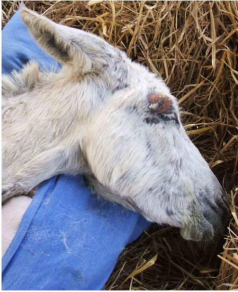
Gandhi, a rescued donkey, died on January 25

Donkeys in Nepal are true beasts of burden. They are made to work till they drop dead. Something MUST be done.