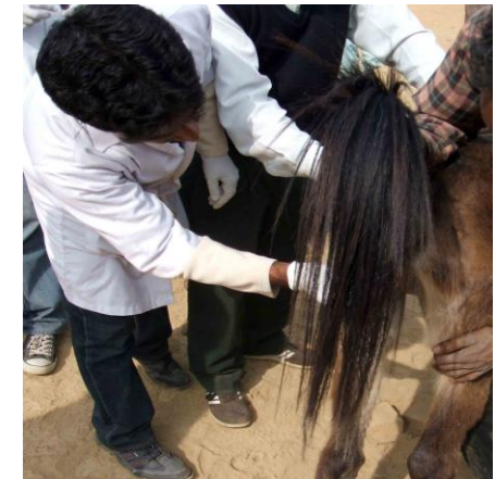
Images of our first Donkey Clinic: Volunteer (student) vets, cleaning a deep tissue wound, donkeys and people gather, taking temperature