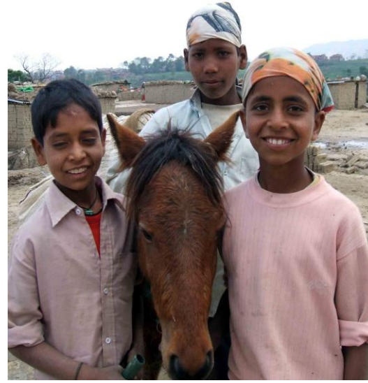
Healthy, happy working kids with horse